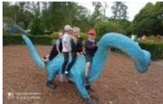
Years R,1 and 2 had such a special day last week, when they visited 'The Dinosaur Park'. They went on the Valley of the Dinosaurs trail, saw all sorts of beautiful animals, danced with Dippy, got lost in the maze and excavated some fascinating fossils. We would like to say a huge thank you to all our children and our brilliant adult helpers for making it such an enjoyable day.