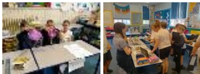
Y5 and Y6 have been teaching the rest of the school about forces at their wonderful science museum.