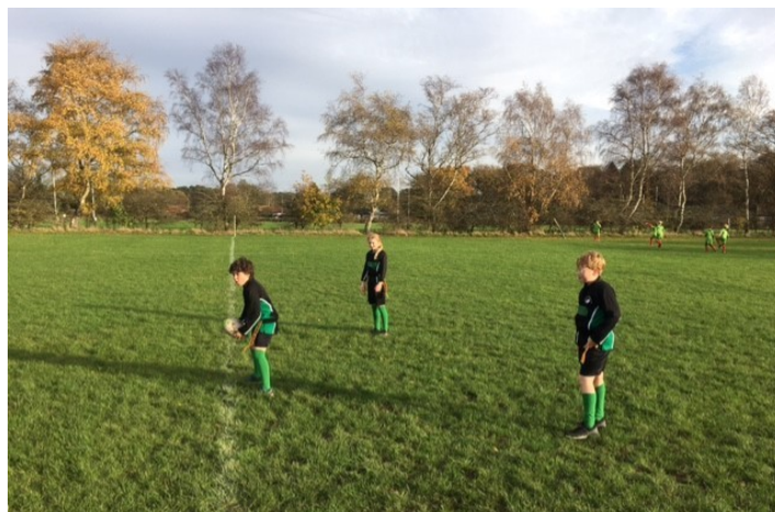
Two teams from Year 5 and 6 had a lovely afternoon playing in the developmental rugby competition at Holt Rugby Club last week.

Y5 and Y6 enjoyed sharing their learning with their families and other classes during their class museum. They showed their knowledge of circuits and had designed and made fairground ride models in DT. They then incorporated and programmed crumble kits to control them.